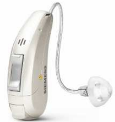
Copyright © 2013 Siemens Hearing Instruments